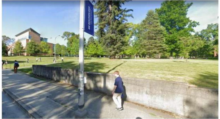
Serves those exiting on north end of the building

Lawn near Parrington across 15th Ave NE from Social Work Building north end.